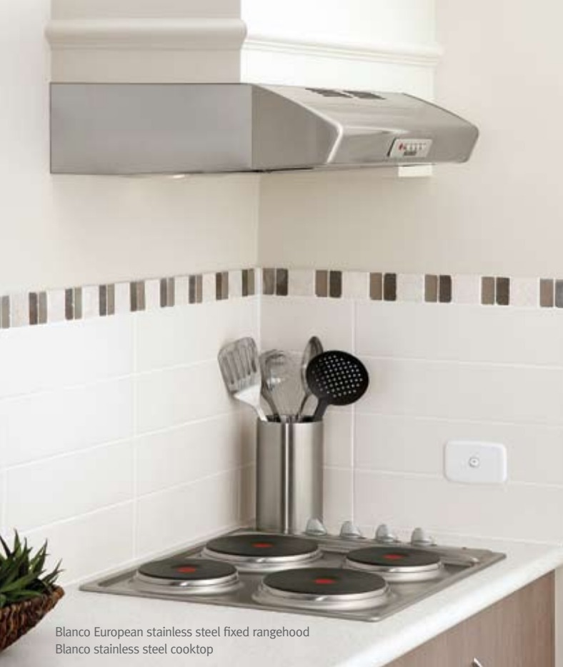
Blanco European stainless steel fixed rangehood Blanco stainless steel cooktop