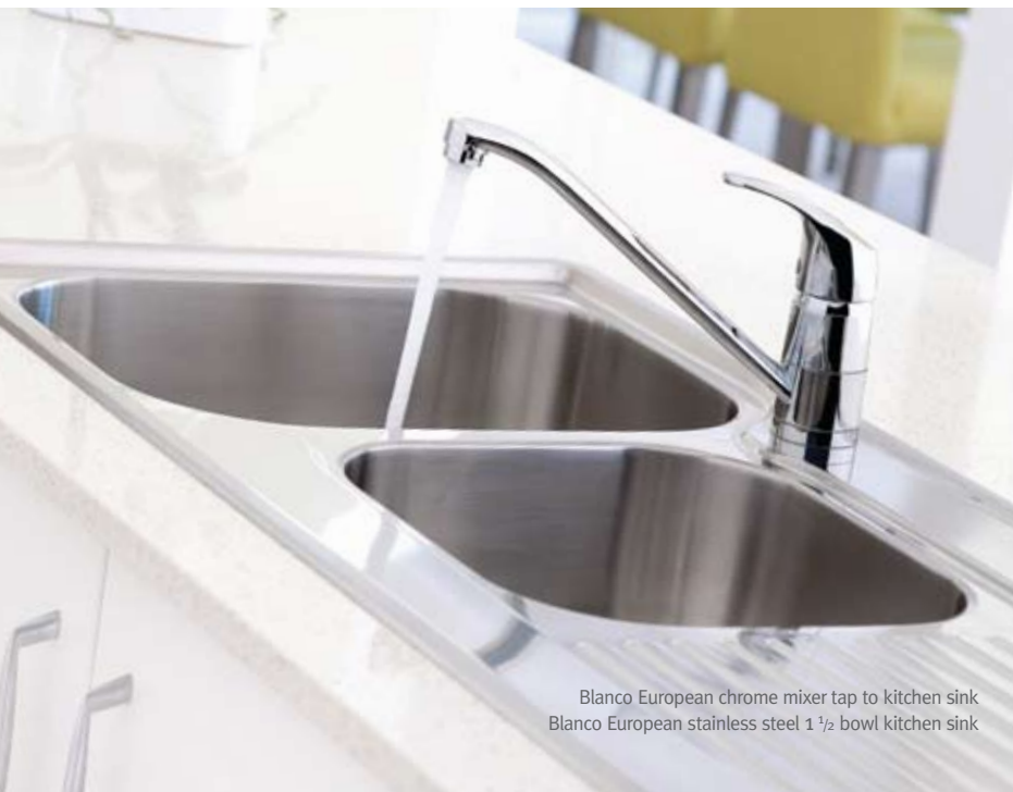
Blanco European chrome mixer tap to kitchen sink Blanco European stainless steel 1 1/2 bowl kitchen sink