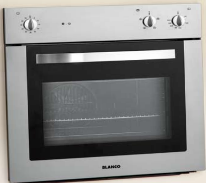
Blanco European stainless steel wall oven Plasterboard wall oven tower with microwave space

Coral Homes will provide a fixed price contract including a fixed price on your site works for complete peace of mind.