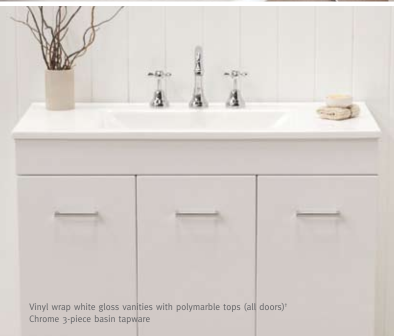
Vinyl wrap white gloss vanities with polymer marble tops (all doors)* Chrome 3-piece basin tapware