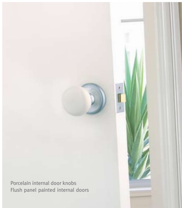
Porcelain internal door knobs Flush panel painted internal doors