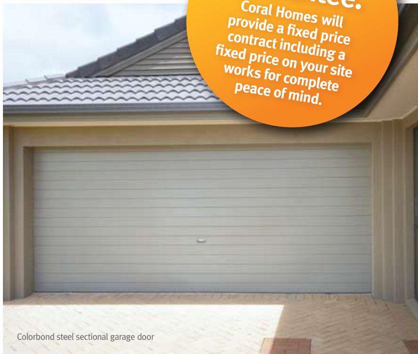
Colorbond steel sectional garage door